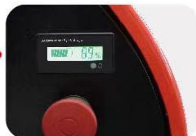
Battery Protection Stopper