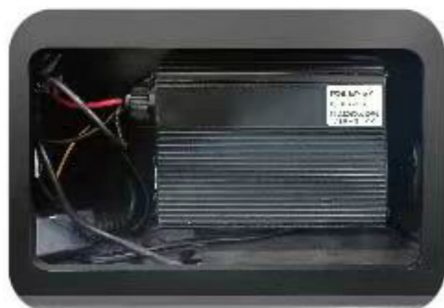
Built-in Charger (Optional)