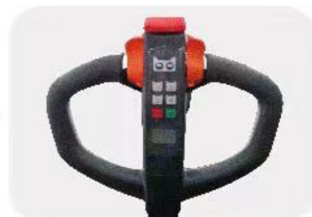
Smart Handle (Optional)